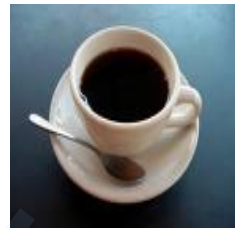
Food and beverages