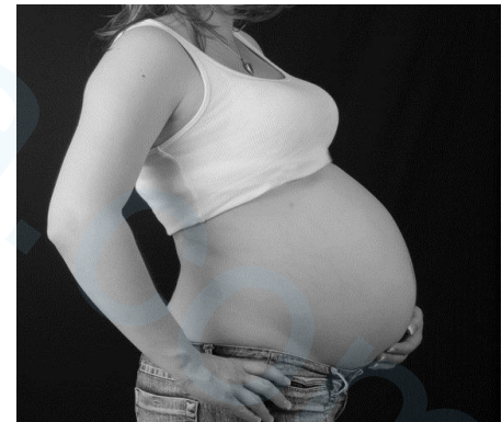
Fell in love