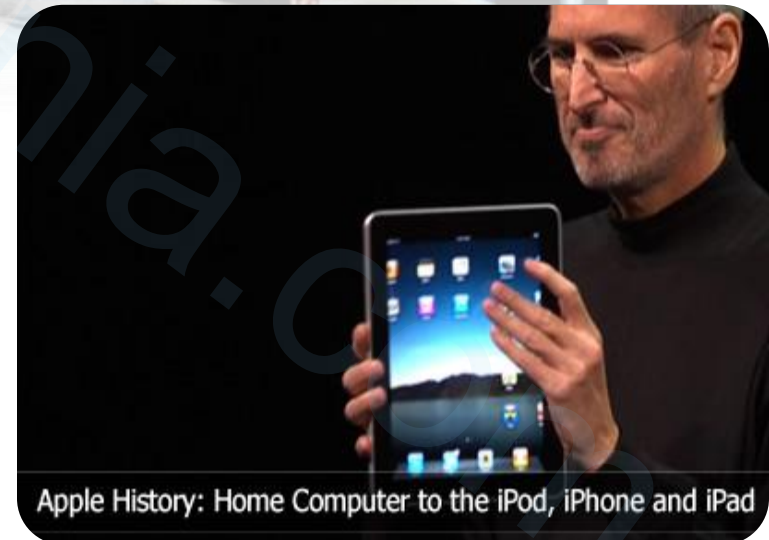
Apple History: Home Computer to the iPod, iPhone and iPad

Why is it important to know your company's history?