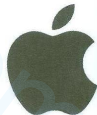
April 1 st , 1976