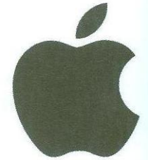
April 1st, 1976