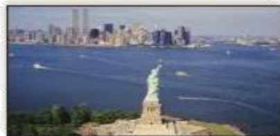
Statue of Liberty and Hudson River