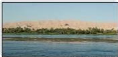
Nile and Desert

95 percent of Egypt's population lives on the banks of the Nile River