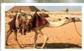
the Sahara Desert