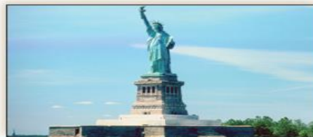
Statue of Liberty, New York